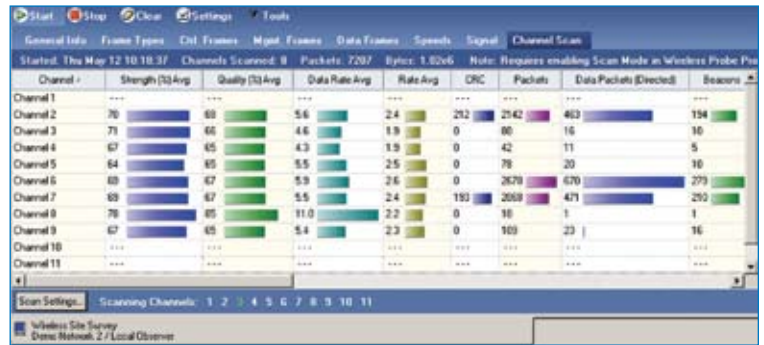
Wireless Site Survey

You can eliminate those uncertainties with Observer's Wireless Site Survey . The Signal tab displays signal strength to help you determine where exactly to place access points. The General Info tab shows access points and the corresponding level of security to determine who is using the network and locate possible security vulnerabilities. The Channel Scan tab shows overall performance statistics such as signal quality and data rates so you always know the condition of the WLAN. Other statistics on frame types, control frames, management frames, data frames, and speed can also be viewed from the Wireless Site Survey.